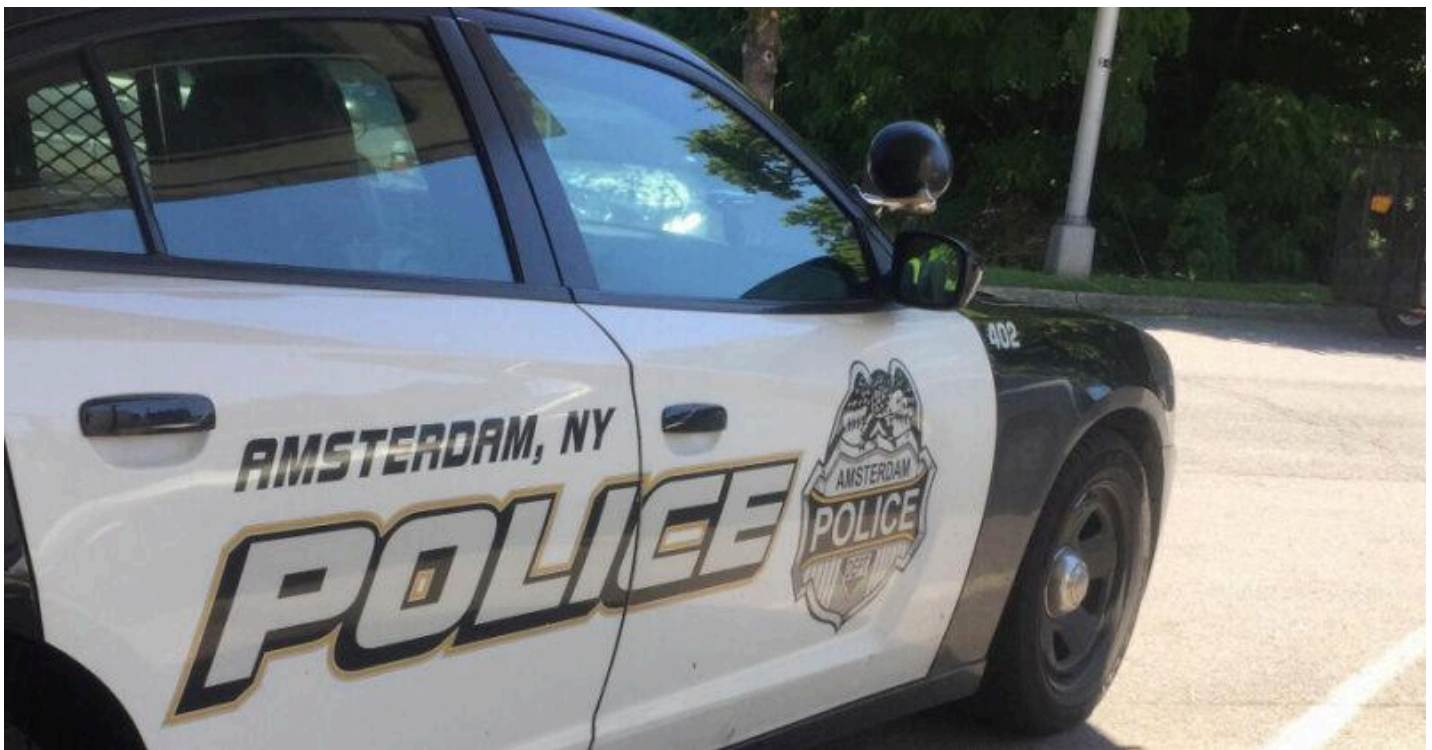
Amsterdam police car